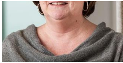
Ryan, Swanson & Cleveland, PLLC Sponsor Since 2014