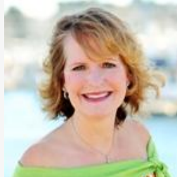
DML Insurance Services, Inc. Member Since 2001 WBO Ruby Sponsor

WOMEN BUSINESS OWNERS ON FACEBOOK Click to "Like" the Women Business Owners business page. Also, if you have a website or blog, you can put a "like" Women Business Owners Button on your own website/blog. Our ID# is 118510208183853. Let us know if you have a Facebook business page and WBO will "like" you too!