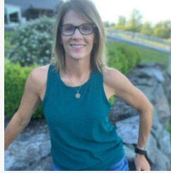
Fitness Training, LLC Member Since 2020